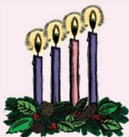
Fourth Sunday in Advent