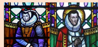
Saint Philip Howard & Anne (Dacre) Howard

We hope you will enjoy and be inspired by these Saintly Spouses as we prepare ourselves for the Feast of All Saints