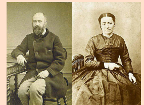
October 21/22 THIS WEEKEND Blessed Luigi & Maria (Corsini) Quattrocchi

On October 14/15 , we learned about Saints Louis & Marie (Guerin) Martin