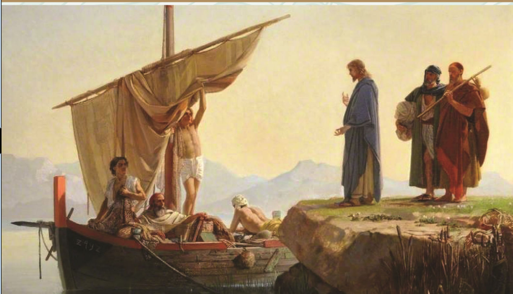
~ MARK 1:18

THEY ABANDONED THEIR NETS AND FOLLOWED JESUS.