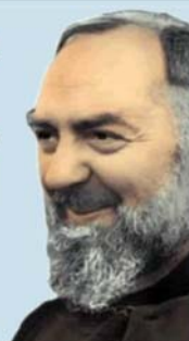
- Saint Padre Pio

"Pray, hope, and don't worry. Worry is useless. God is merciful and will hear your prayer."